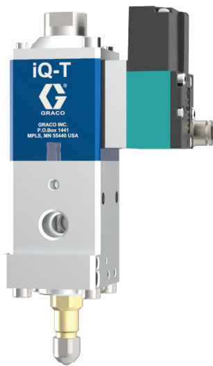
iQ-T Tip Seal

Three sealing options let you optimize your dispense based on your material and application