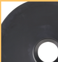
55 gal (200 l)