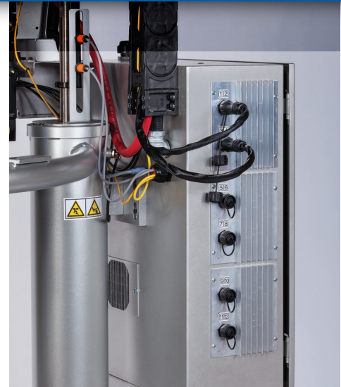
Six connection points for the 12 customer defined heat zones

Graco offers a complete line of Therm-O-Flow bulk hot melt systems and "point of use" melt systems – each can be configured to fit your specific application.