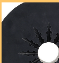
5 gal (20 l)