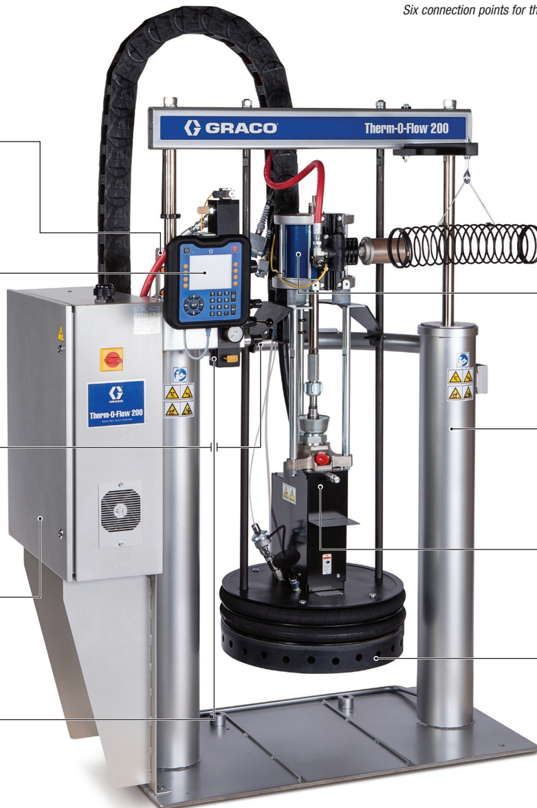
Therm-O-Flow 200 (55 gal)

Easy-to-maneuver casters are sold as a kit for the 5 gallon system