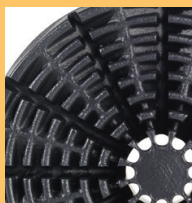
5 gal (20 l)