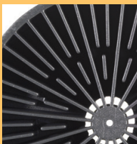
55 gal (200 l)