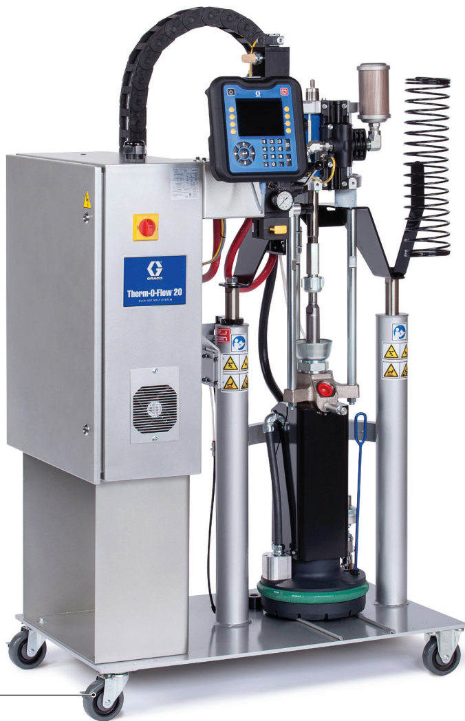
Therm-O-Flow 20 (5 gal)