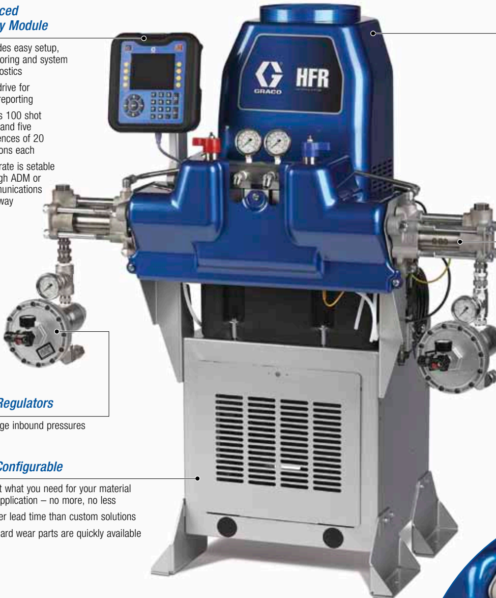
Z-Series Piston Pumps