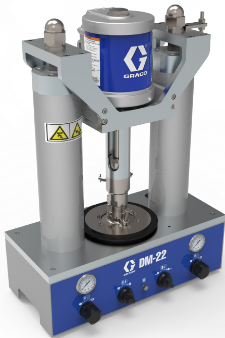
DynaMite 22 Supply Pump