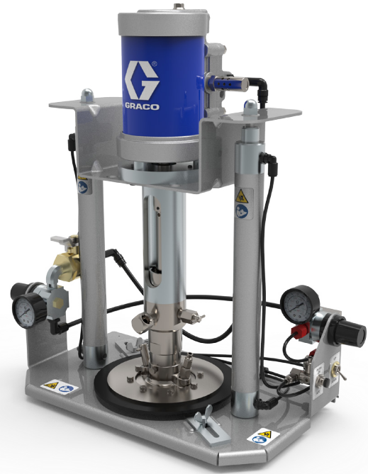
DynaMite 190 Supply Pump